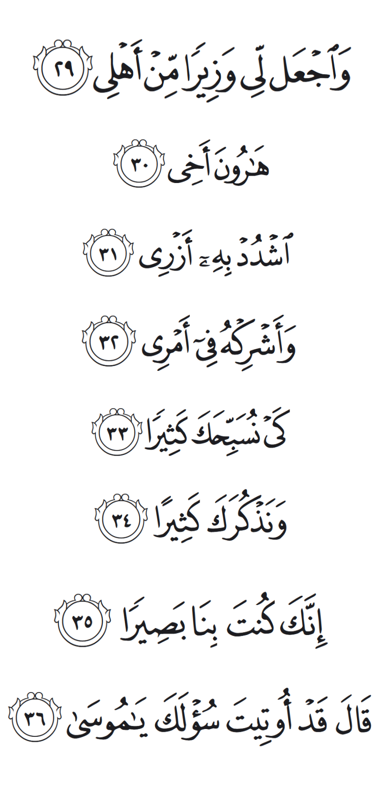
Chapter 20 - Taha, Verses 29-36